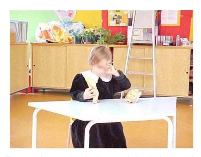
Figure 3 A young girl crying because she has broken her doll.

The pictures had been previously tested on two classes (not included in this study).