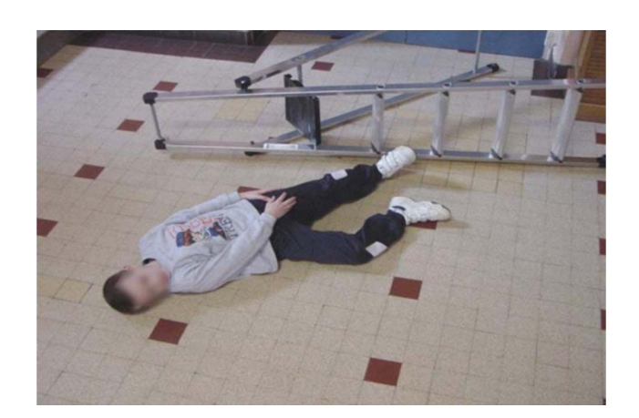
Figure 2 A boy who has fallen off a stepladder and is holding his leg.