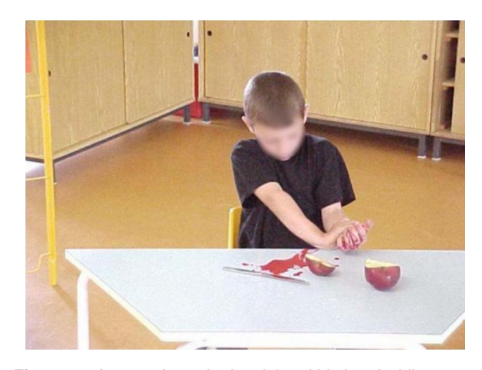
Figure 4 A young boy who has injured his hand while peeling an apple.

To ensure anonymous grids, the results were collected by Ministry of Education staff. For reasons of confidentiality required by the national education system, the researchers did not have access to personal data from children. Only fully completed assessments were analysed. Data were presented as percentages with 95% CIs. Statistical analysis of the results was performed using a \chi^2 test (significance level: p<0.05). Analyses were