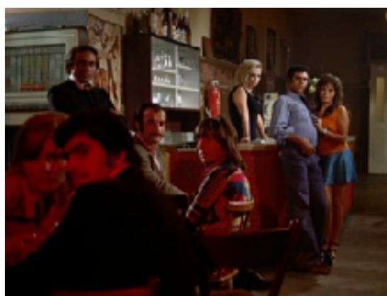
Fig. 4: Angst essen Seele auf . Dir: Reiner Werner Fassbinder (5:56)

As in Crossing the River , dancing is the element in Ali: Fear Eats the Soul that brings the two unlikely lovers together under the blank and disapproving stares of patrons in a bar. Fassbinder shoots the scene that emphasizes the distance between the couple and the people observing them, with both groups seen from a low angle and the viewer in position to watch their reactions closely. The words “very nice but no work” (5:40), pronounced by Ali about his native town, remind us of the reluctant migrations from the Caribbean that Phillips sums up as a flight from beauty: “Ambition going to teach you that you going has to flee from beauty, Michael. Panama? Costa Rica? Brazil? America? England? Canada, maybe? West Indian man always have to leave his islands for there don’t be nothing here for him [...]” ( The Final Passage 42). As for Emmi, she evinces a prior capacity for resistance to prejudice, revealing, on her first evening with Ali, that she