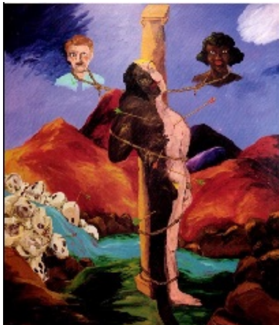
Fig. 2: Robert Colescott, Knowledge of the past is key to the Future , ( St Sebastian ).1986.

I thought if I split him down the middle, he would represent both races and sexes and show the violence done to everybody," Colescott explains. "The lesson of history is that violence not only hurts the victims, it causes great pain to the perpetrators. I believe that the white people doing all that stuff to black people in South Africa will be greatly harmed by it. The Holocaust damaged the psyche of the German people." (Muchnic "Outrageous Visions")