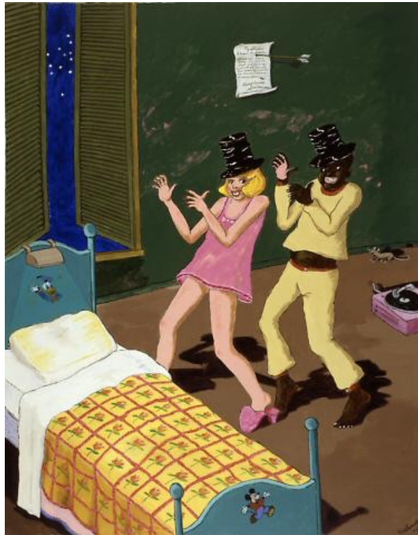
Fig. 1: Colescott, Robert. My Shadow . 1977. Acrylic on canvas, 84 x 66 in.

Disney characters, although the accent put on showmanship—top hats and matching dance steps—underlines that the couple is cunningly making a show of resistance out of their transgression.