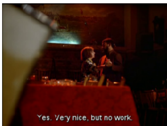
Fig. 3: Angst essen Seele auf . Dir: Reiner Werner Fassbinder (5:40)