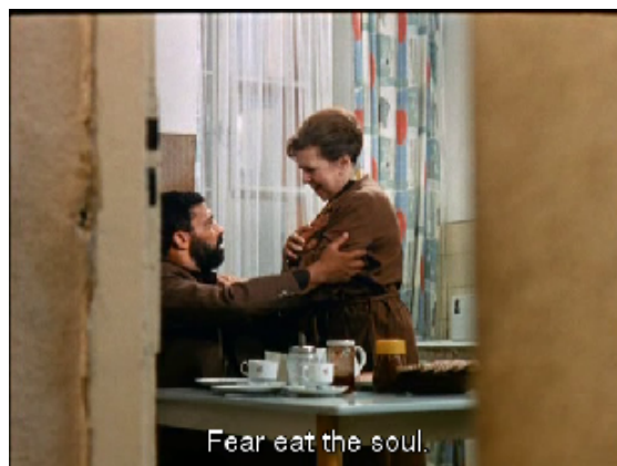
Fig. 5: Angst essen Seele auf - Dir: Reiner Werner Fassbinder (20:17)

married a Polish Fremdarbeiter (a forced labourer under the Nazi regime) who had stayed on after the war. The marriage was frowned upon by her parents who, like Emmi herself, had been Nazi sympathizers. Emmi readily admits that she has been lonely: “It’s good to talk to someone. I am alone most of the time. All the time, really” (10:14). Loneliness is also what brings Travis and Joyce together, or again Solomon and Dorothy in A Distant Shore .