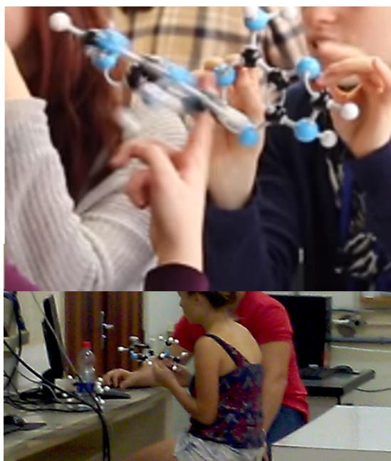
Figure 2. Students using molecule models as a toy. Top: play test in Paris. Picture from the trailer (Taly, 2018b). Bottom: Brazil workshop. Picture taken from a short movie (Taly, 2018c).

A complementary observation occurred during the latest workshop with high school students. One student who was rather reluctant to play the game 1 , staying aside of his group. Later this student played with a molecule spinning it as a top. Interestingly, he then participated in the resolution of the game.