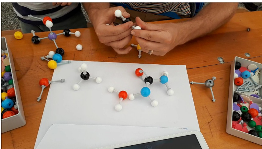
Figure 3. Players using the molecular kit as construction material during a citizen science event in Geneva.