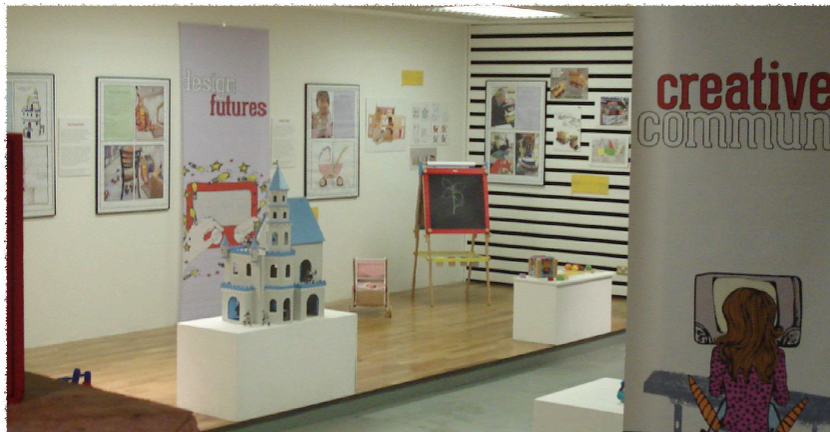
KTP Projects at All Work and No Play Exhibition, Collective Collaborations Gallery in Northampton June 2012