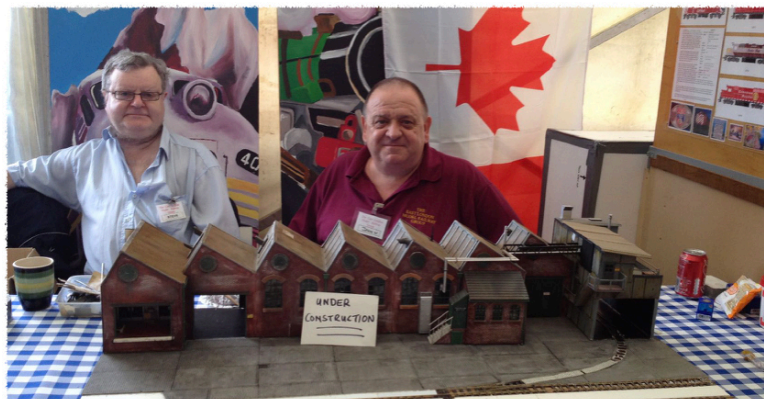
Model Train Engineering enthusiasts exhibiting their model train shed in Newham, London