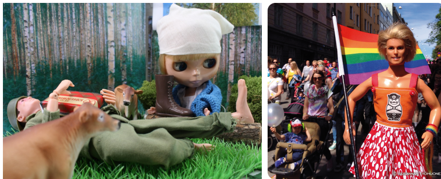
Figures 1 and 2; 1. Karjala 1944. Photoplay of the author based on real-life war time events in Finland photoplayed according to manuscript by comic artist Hanneriina Moisseinen. 2. Photoplay by Susanna Mattheiszen depicting Ken of Finland , 'a gaudy male doll who likes to wear dresses.'