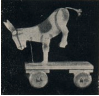
Figure 7. Jumping Donkey

The mechanical toy category includes; a jumping Mickey Mouse, a swimmer (well-known interwar toy) which mimics a swimming movement, a jumping donkey, twisting rabbit, and a jumping man etc.