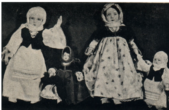
Figure 4. Dolls in National Costume

The patterns for the traditional costumes were inspired by Aggeliki Chazimichali's (a distinguished folklorist of the time) books, from city museum visits, where costumes were on display, as well as from everyday life. The costumes included examples of bourgeois or peasant women, women from Hydra, Crete, Macedonia, Mani, Corfu, Arta, Pogoni, Trikeri or Salamis, dressed in "national" costumes. Also depicted were Amalia (named after the Queen Amalia who used to wear "traditional Greek" costumes with western accessories 8 ), the Evzone (whose costume has numerous connotations), several of these ladies' companions and the man from Mani.