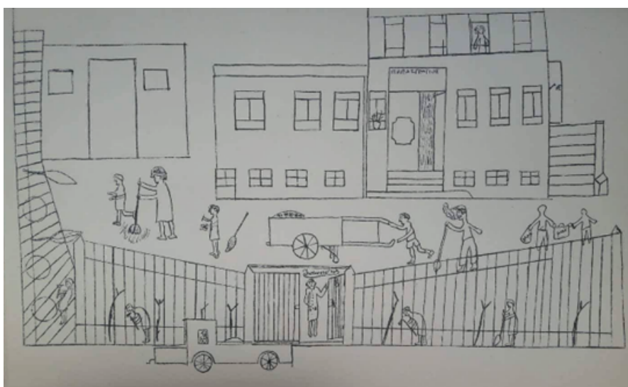
Figure 1. The Planting

For the purposes of this paper, attention is paid to one of the implications of this drawing: the transformation of children's experience to include raw materials for the construction of artistic toys or, alternatively, of toys as works of art, created by children.