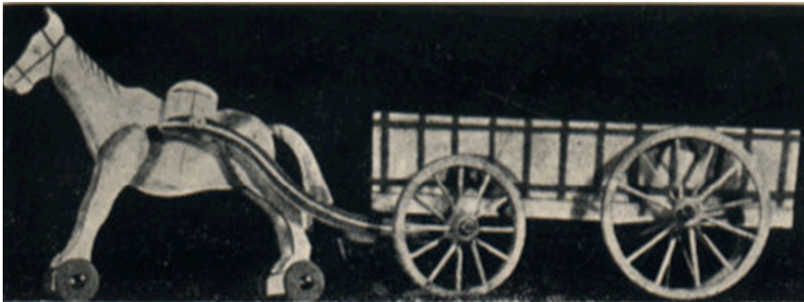
Figure 8. Four - Wheel car

Adopting the Froebelian mode of instruction with an industrial twist, the School produced the Froebel gifts themselves, but also “My Buildings”, the box of cubes used in various construction sets, like “My Printing House”(a box with letters and numbers), “My Village” (a set with 35 pieces including houses, churches, mountains and trees), “My Island” ( a 40 piece set (including houses and boats), “My Jungle” (a box with 10 wild animals) or “Noah’s Ark” (Germany’s toy producing flagship) (Benjamin, 1930, p. 112). This category included; a dollhouse with furniture (bookcases, tables, beds with mattresses, coloured or batik sheets and pillows, chests, dresser with mirrors etc.). The School also produced assembled toys like the “Wagon with the Driver” (comprised of 30 pieces), a “Peasant House” and board games, like checkers, and a tombola, in either wooden or papers boxes.