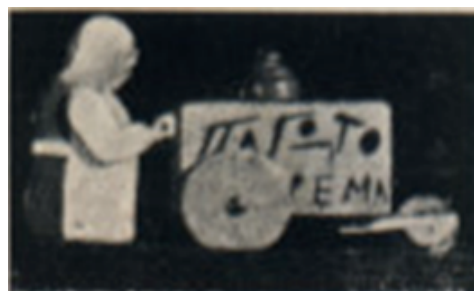
Figure 3. The Wooden Ice-Cream Seller

The same process applied to the building of all of the toys: an idea formed by the student's experience or surroundings, was captured on paper, and later in a clay, plaster, paper or metal mould and, finally, painted, decorated or dressed depending on the type of toy.