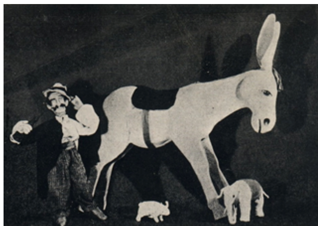
Figure 5. The Drunkard (... with a Donkey, a Pig and an Elephant)

The everyday characters included an old lady (with or without distaff), the Vlach (with or without crook), man from Urla, national guardian with kilt, islander with knickers, milkman, peasant, butcher, shepherd, peanut seller, gypsy woman and, finally, a child, all made from stockings. In addition, a drunkard and a villager, made from either stocking or compressed paper.