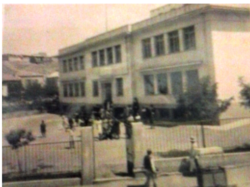
Figure 2. The Ice-Cream Seller

drawing, which was praised by the school's Artistic Committee, eventually became a toy, reproduced in the production lab, and found its way into the marketplace.