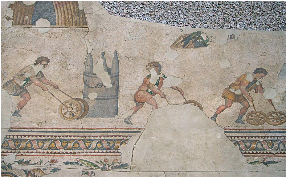
Figure 1. Mosaic floor, courtyard of the Palace (5 th cent. CE).

The poet Martial (1 st cent. CE) paid great attention to children's ability to transform everyday objects into toys 11 . He observed that they easily knew how to use a wheel tyre as a hoop: "Hoop ( trochus ). The wheel ( inducenda rota ) must be fitted with a tyre. You give me a useful present. This will be a hoop ( trochus ) to boys ( pueri ), but a tyre ( cantus ) to me" ( Epigrams , 14.169; transl. D.R. Shackleton Bailey, Loeb). Actual wheels, used as toys, appear in a few pictures displaying imaginary contests, as on the famous courtyard mosaic floor of the imperial palace in Constantinople. Four children are running, each with two small wheels controlled by a stick (fig. 1; 5 th cent. CE) 12 . The children wear blue or green tunics, mimicking the Blues and Greens factions. They run around the metae or conical poles with great skill and concentration – one looking backwards at his rival, as though they were real charioteers in the hippodrome.