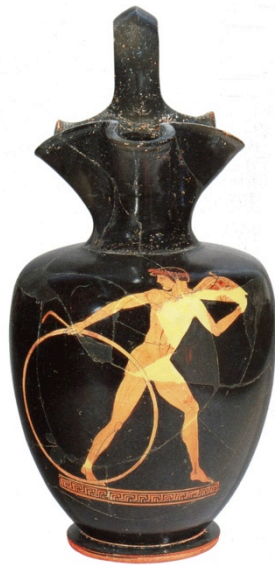
Figure 4. Attic red figure oinochoe (c. 460 BCE). Tampa Museum of Art, Joseph Veach Noble Collection 1986.073. After Neils/Oakley 2003, fig. 76 c.

The Latin clavis , “the key”, refers to a new sinuous or hook-like shape 17 , depicted on several images (fig. 3, 6, 7, 9a). Antyllus adds that the material of this new type of rod ( elatēr ) is made of iron, with a wooden handle.