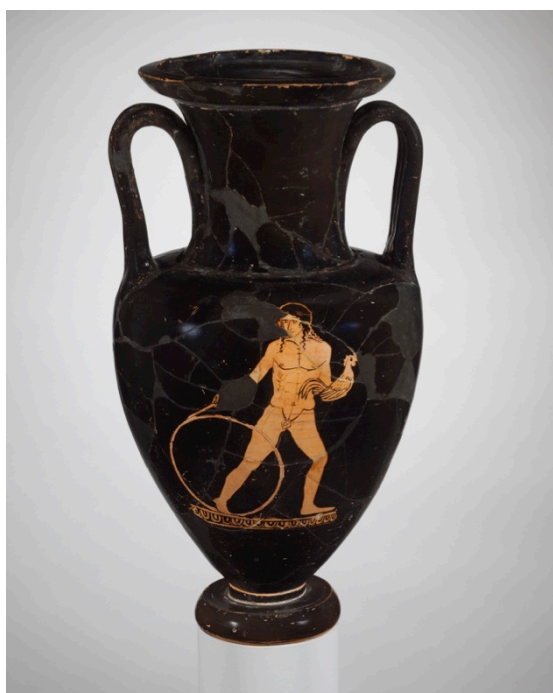
Figure 5. Attic Nolan neck-amphora (460–450 BCE). New York, MMA inv. 96.18.74.