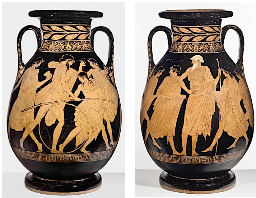
Figure 8. Attic red-figure pelike (470-460 BCE). Basel, Antikenmuseum Basel und Sammlung Ludwig Inv. BS 483.

transl. R.G. Bury, Loeb). On a pelike by the Hermonax painter in Basel, hoop rolling takes place in the gymnasium, marked by herms below each handle (fig. 8; 470-460 BCE) 22 . On one side, Zeus is grasping the shoulder of Ganymede who is holding the hoop stick. The irruption of the god disturbs another game of the same age class: behind Zeus, a second boy holds a large spinning top in one hand and a whip in the other; on the back, four young men flee, in the middle a white-haired man stands, perhaps the paidotribe 23 .