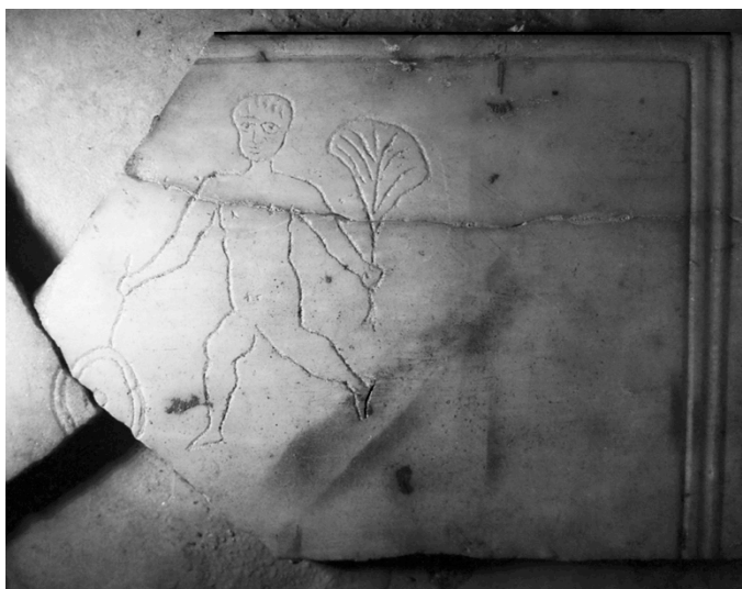
Figure 11. Rome, marble plaque of loculus, Catacomb of Callixtus, in situ (3 rd -4 th cent. CE). After Bucolo 2013, fig. 3.