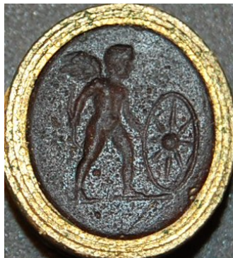
Figure 2. Gem of glass paste imitating sard (1 st cent. BCE). London, The British Museum, 1923,0301.489.

A glass paste in the British Museum (fig. 2; 1 st cent. BCE) depicts Eros controlling a six-spoke wheel, demonstrating his divine agency over love.