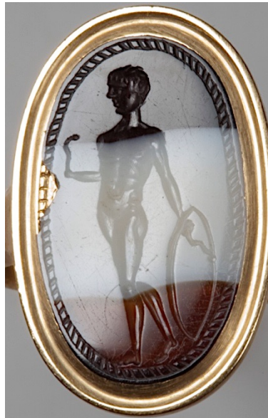
Figure 6. Sard gem (1 st cent. BCE).

Berlin, Staatliche Museen, Antikensammlung FG 927.