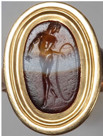
Figure 7. Sard gem (1 st cent. BCE). Berlin Staatliche Museen, Antikensammlung FG 928 (ex. Stosch collection).

Another sard in Berlin (fig. 7; 1 st cent. BCE) 20 shows a player using a stick to guide a hoop while running and looking behind.