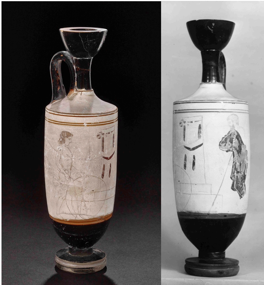
Figure 10 a, b. White ground lekythos (440-435 BCE). London, The British Museum 1920,1221,3.

On the left, an anonymous, naked, young boy with long hair, walks forward, head bent, focused on rolling his hoop. On the right, a bearded man, draped in a black himation, looks at him, leaning on a long stick; he stretches the right hand towards the child who does not look at him, absolutely fixated on the hoop. Traditionally, the scene is interpreted as alluding to a moment of daily life entertainment, and to a homoerotic relationship between two men 36 . Another possible reading challenges this view. The image of the hoop rolling may relate the child to Ganymede, without eroticism, but with an eschatological hope.