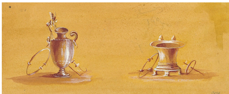
Figure 3. Watercolour reproduction of a wall-painting, Pompei V, 1, 18, House of the Epigrams, now lost (1 st cent. CE). After http://arachne.uni-koeln.de/item/marbilder/5022204

against a hydria, and on the right, another rests against a krater this time with three leaf-like items, 14 possibly nailed to the hoop, like the bells or coins painted in 1560 by Pieter Bruegel the Elder for his “Children’s Games” 15 .