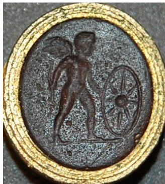
Figure 2. Gem of glass paste imitating sard (1 st cent. BCE). London, The British Museum, 1923,0301.489.

A glass paste in the British Museum (fig. 2; 1 st cent. BCE) depicts Eros controlling a six-spoke wheel, demonstrating his divine agency over love.