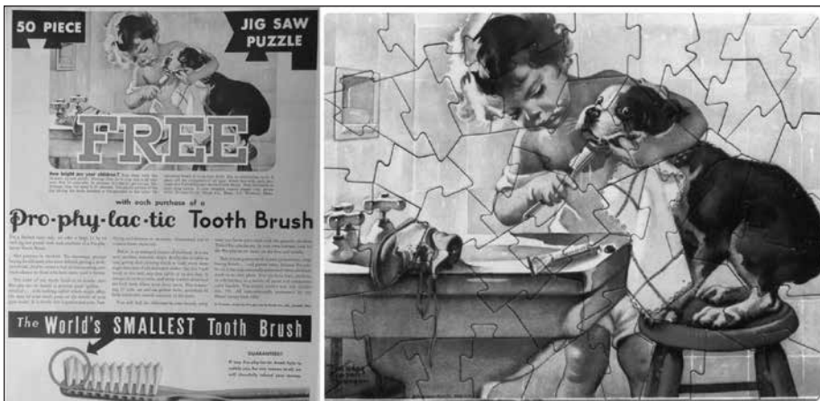
Figure 1. Lambert Pharmacal advertised its toothbrush and its puzzle giveaway in multiple issues of the Saturday Evening Post and other popular magazines in July 1932.

As the economy declined, interest in jigsaw puzzles rose. In response, the major puzzle companies increased production and issued catalogs more frequently. Parker Brothers, for example, doubled its employment of puzzle cutters between 1928 and 1931. (Williams 2004). At first, people did traditional wooden