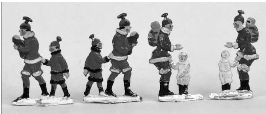
Figure 6. Figures of women with children.

Nanook of the North renders Inuit people as simultaneously fragile and in an older stage of civilization. Flaherty begins the film by describing Nanook’s (the main character of the film) land as a “hunting ground,” relegating the community’s livelihood as one centered around the killing of animals (as opposed to engaging in American commerce, for instance). 32 The majority of the film follows Nanook on various hunting trips, stressing that the community would not survive without the consumption of fish, walrus, Arctic foxes, and other wildlife. The film shows Nanook on a fishing trip operating rudimentary tools, such as a harpoon, to catch fish, while he kills the animals with his teeth. Literally overjoyed with his catch, Nanook smiles at the camera as he holds the bloodied fish.