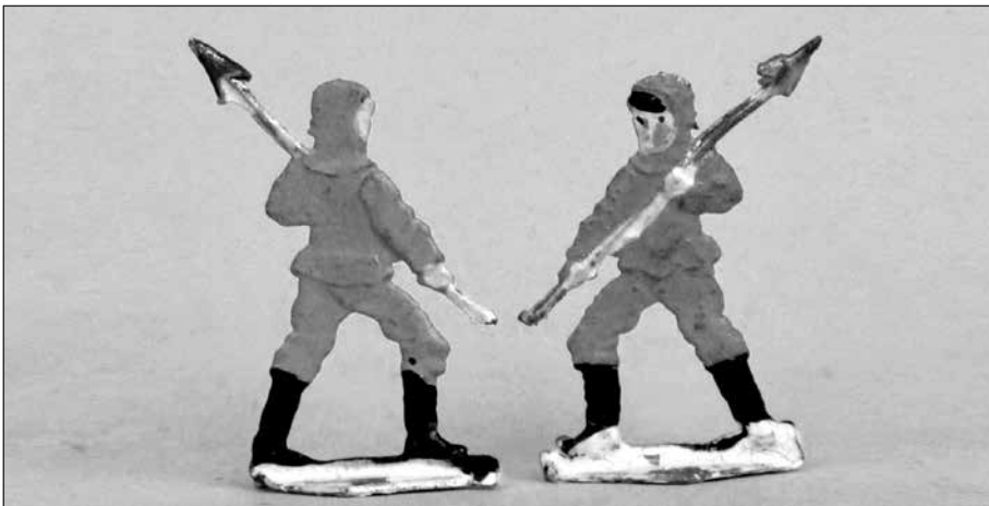
Figure 7. Figures of two men holding spears.

The potential for children to act out the kinds of families that were common in middle- and upper-class White society reflects the limits to imagining foreign Others in toys. Although many Inuit families adopted sex-based skills (i.e., men most commonly hunted while women took care of the children), these divisions of labor were permeable and not a reflection of assigning greater inherent value to one sex over another. Additionally, Inuit communities are both matrilineal and matriarchal, a fact not evident in the toy set, which includes over thirty-five men and only four women. In other words, the (perceived) similarity between American familial lifestyles and those of the Inuits instills the idea that the “correct” way for Inuit families to live is in a single-family home with rigid gender