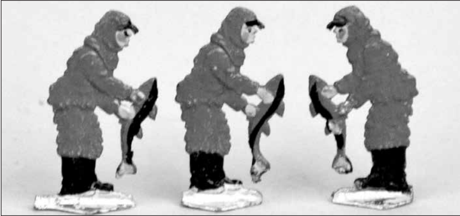
Figure 5. Figures of three men holding fish.

To most contemporary Americans, these images of the Arctic were not something they would ever see firsthand outside of books. Although there were numerous expeditions to the region in the late-nineteenth and early-twentieth centuries, such as Robert Peary's infamous voyage to Greenland in 1897, they were never for the everyday consumer and tourist. In other words, Inuits geographically existed comfortably outside the world that most Americans occupied. Users of the Escimo toys, then, might become curious and fascinated with an environment they were likely never to see in person. Geographical distance, in other words, allowed children the freedom to explore and understand the Arctic environment without having to make the dangerous voyage northward.