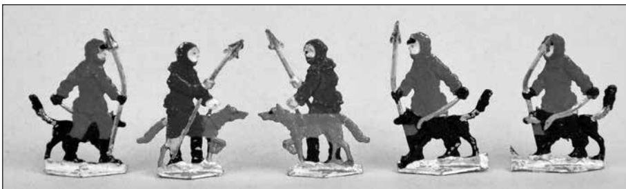
Figure 1. Men figures with dogs and spears.

Many features of this set stand out both from other toys used during the early twentieth century. Flat, lead-based toys, for instance, largely depicted (White) soldiers, or, on occasion, a highly stereotyped image of Western cowboys and Indians, rather than Inuit People, making the composition of this set stand out significantly. 8 Indian toys, in general, were common during this time period as well, although they most often involved the dress and setting associ-