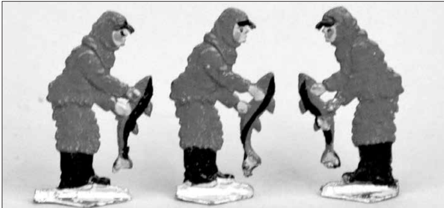
Figure 5. Figures of three men holding fish.

To most contemporary Americans, these images of the Arctic were not something they would ever see firsthand outside of books. Although there were numerous expeditions to the region in the late-nineteenth and early-twentieth centuries, such as Robert Peary's infamous voyage to Greenland in 1897, they were never for the everyday consumer and tourist. In other words, Inuits geographically existed comfortably outside the world that most Americans occupied. Users of the Escimo toys, then, might become curious and fascinated with an environment they were likely never to see in person. Geographical distance, in other words, allowed children the freedom to explore and understand the Arctic environment without having to make the dangerous voyage northward.