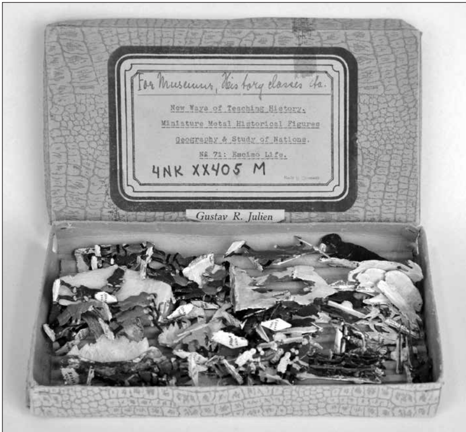
Figure 2. Container for toy set.

and in the context of the 1920s. But toys were increasingly more common in schools for children in wealthy families, suggesting that they were quite likely used in classroom settings.