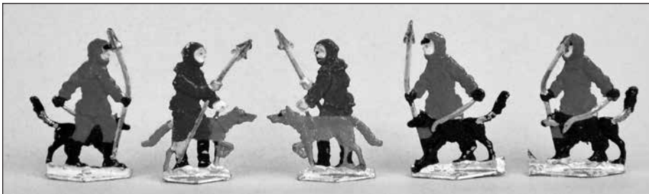
Figure 1. Men figures with dogs and spears.

Many features of this set stand out both from other toys used during the early twentieth century. Flat, lead-based toys, for instance, largely depicted (White) soldiers, or, on occasion, a highly stereotyped image of Western cowboys and Indians, rather than Inuit People, making the composition of this set stand out significantly. 8 Indian toys, in general, were common during this time period as well, although they most often involved the dress and setting associ-