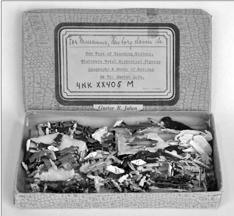
Figure 2. Container for toy set.

and in the context of the 1920s. But toys were increasingly more common in schools for children in wealthy families, suggesting that they were quite likely used in classroom settings.